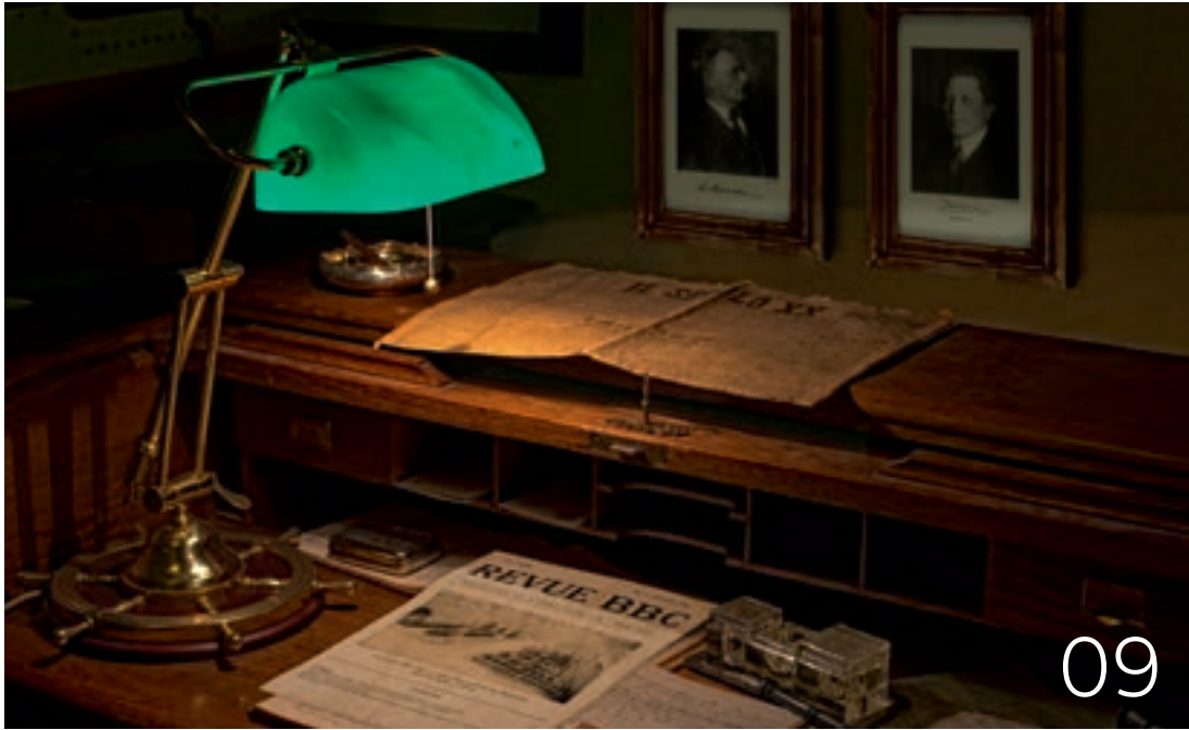
The shoulders of giants