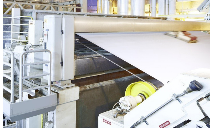
04 Celulosa Arauco uses ABB Quality Control Systems. Pictured here is an ABB Network Platform that is scanning the paper web to ensure that all quality parameters are met.

The performance of each control loop is evaluated based on responses related to: control, process, and signal conditioning. Each loop that gets a lower rating is counted as having an issue that needs investigation. This does not always mean there is a problem. However, a large number of issues indicate that there is room for improvement. The following figure shows the number of issues by each category.