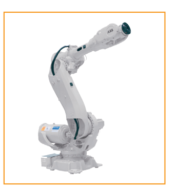
IRB 6640-235/2.55 IRB 6640-180/2.8