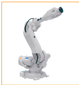
IRB 6640-235/2.55 IRB 6640-180/2.8