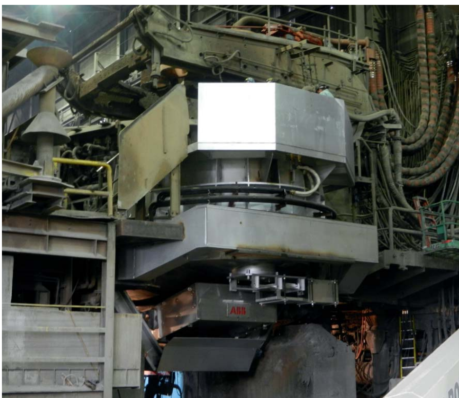
ArcSave is installed beneath a furnace.

ABB EAF-EMS has been around for a while now: it was first patented over 80 years ago by ABB Metallurgy. The technology now has more than 1870 references worldwide, including - 153 EAF-EMS installations. Installed under (but not in contact with) the furnace bottom shell, it produces a travelling electromagnetic field through the furnace shell and generates convection flow within the melt. This electromagnetic field penetrates the