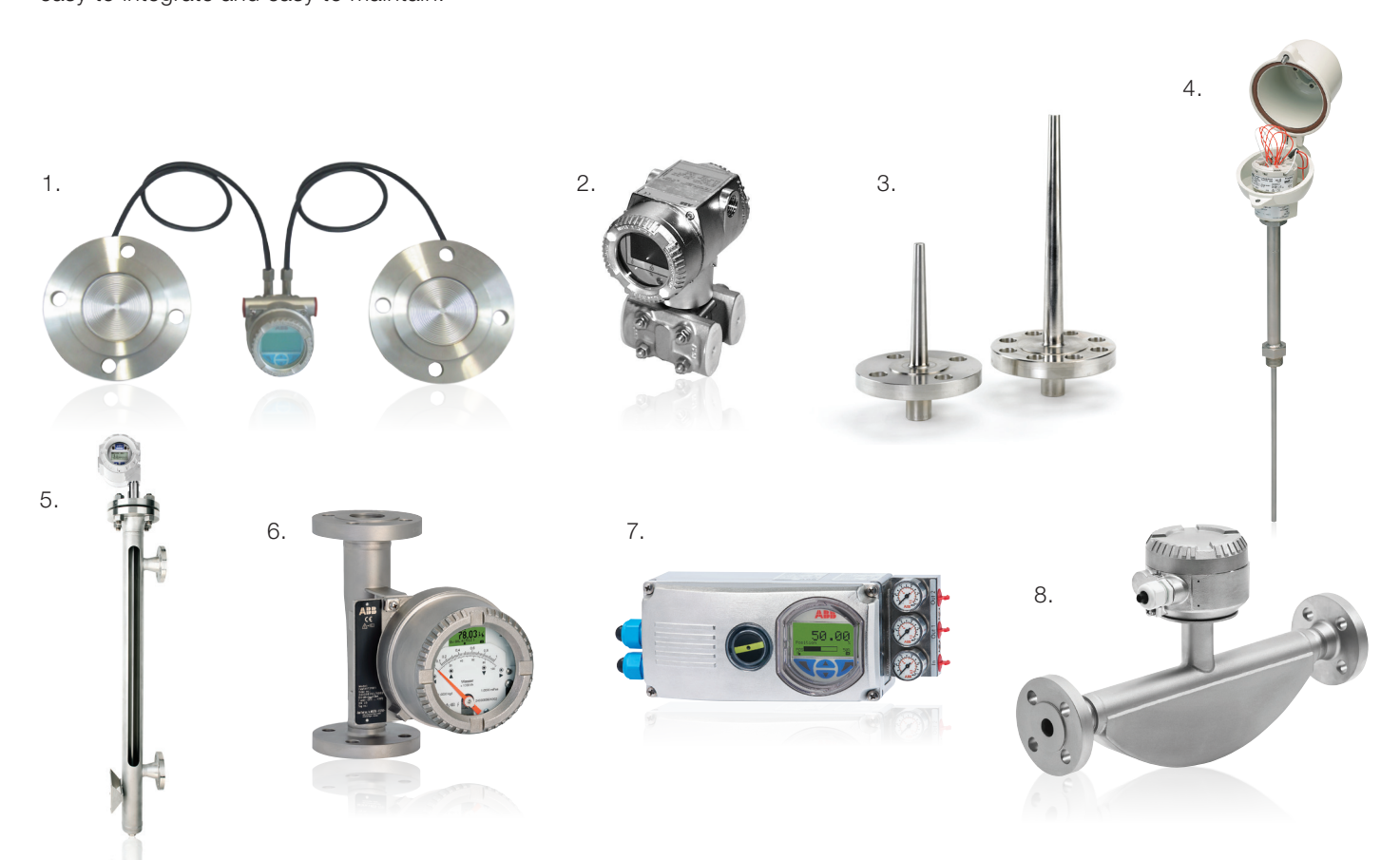
1. Differential pressure transmitters with remote seals 2. Differential pressure transmitter 3. Thermowell 4. Temperature sensor with integrated transmitter 5. Magnetic level gauge 6. Variable area flowmeter (rotameter) 7. Intelligent electropneumatic valve positioner 8. Corriolis mass flow- and density meter

ABB's R&D teams and factories are continuously improving and developing our portfolio for the oil and gas market.