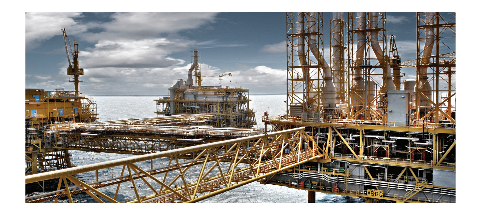
ABB has a proven track record as a main instrumentation contractor (MIC) to the oil, gas and petrochemical industries. Our approach leads to substantial benefits for both the EPC contractor and the end customer, and to significant savings in capital and operational expenditure.