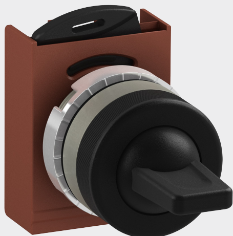
ABB pilot devices are engineered for total reliability. Our products are tested to extremes and proven in the toughest environments. Their innovative designs simplify the entire process, from selection to installation.

Modular toggle switches P9MC is our most versatile range with high level of flexibility and market leading electrical ratings. Engineered for total reliability, longer lifetime, and highest mechanical durability. Self-cleaning contacts ensure reliable operation without the need for maintenance, increasing uptime. High degree of protection guarantee reliability in extreme environments. The innovative design simplifies the entire process, from selection to easy and quick, tool-free installation. The perfect solution for every application.