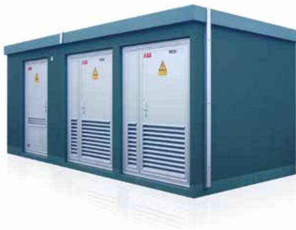
ABB has developed an innovative line voltage regulator with RESIBLOC technology that enables an automatic intervention on voltage fluctuations. This reliable and efficient solution is an economically alternative to conventional network expansion, especially for wind and PV applications.