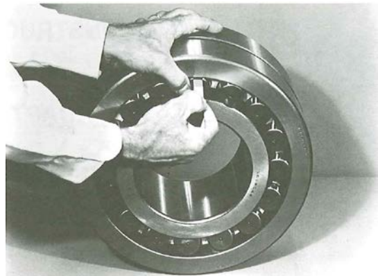
Figure 1 - Internal Clearance