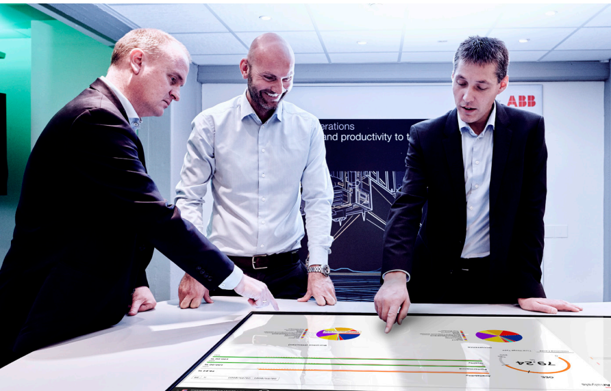
ABB Ability™ Manufacturing Operations Management OEE Application

The ABB Ability™ Manufacturing Operations Management Overall Equipment Efficiency (OEE) Application uncovers hidden potential and maximizes equipment utilization, uptime and quality. It enables customers to calculate and analyze Overall Equipment Effectiveness measure, based on data collected from their production processes.