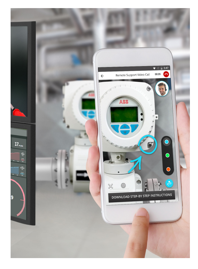
ABB Ability<sup>tm</sup> Remote Insights for service