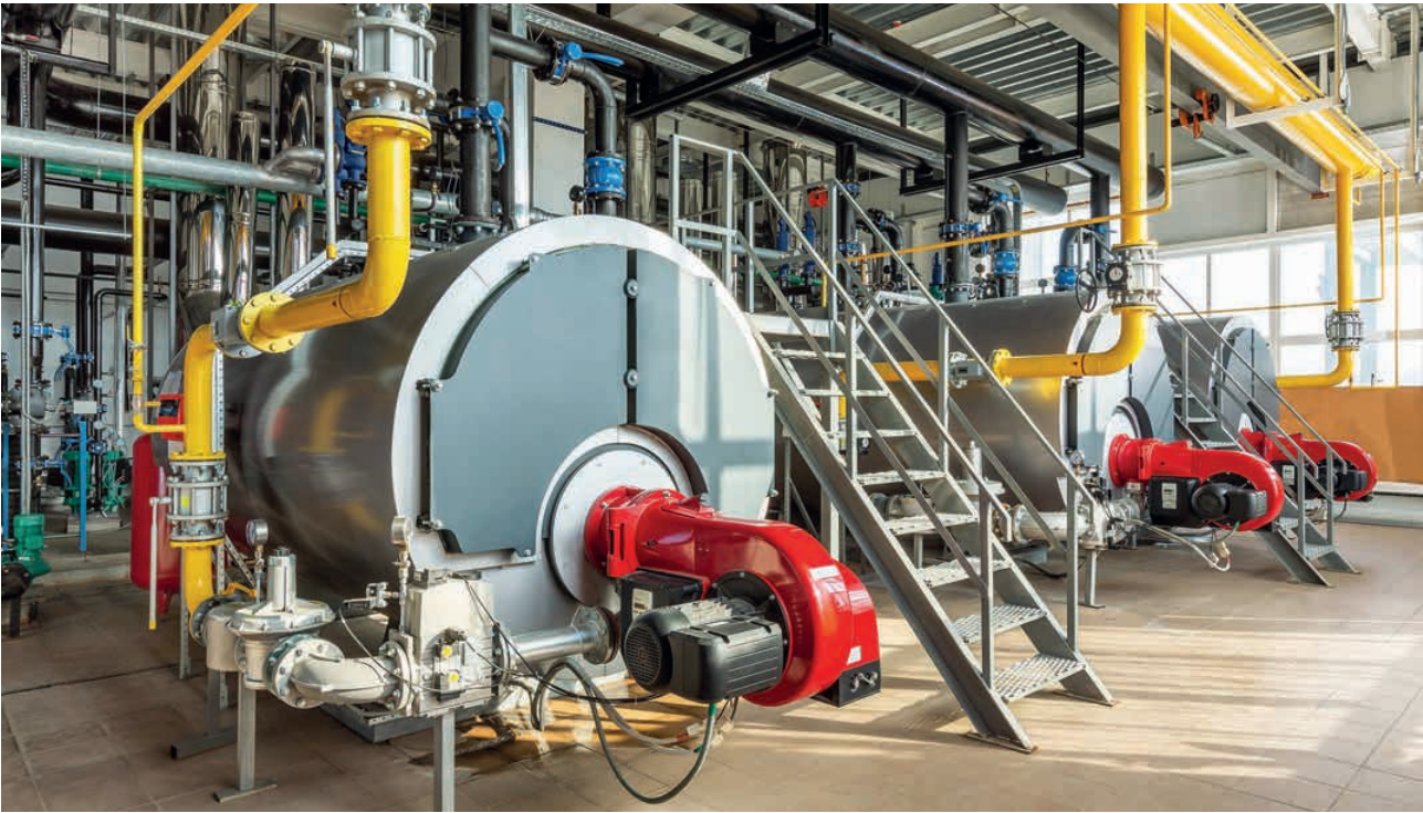
Adopting variable speed drives for district energy systems helps operators match output to demand