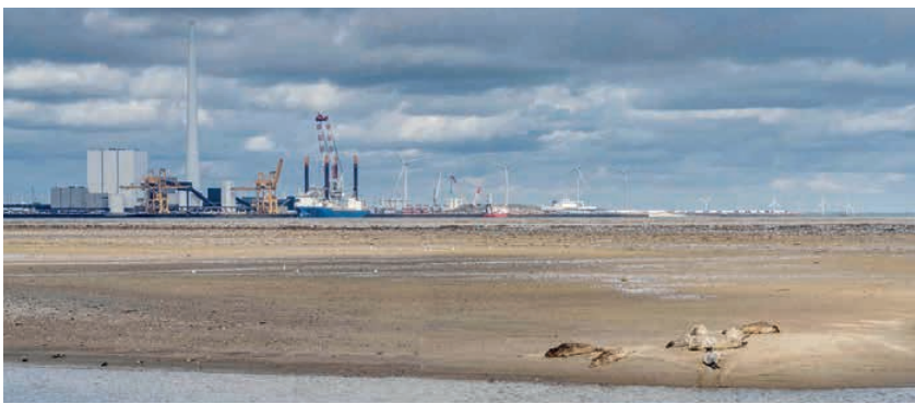
Figure 2. The capital of Esbjerg and the heat production facilities is in close proximity from the wildlife in the Wadden Sea