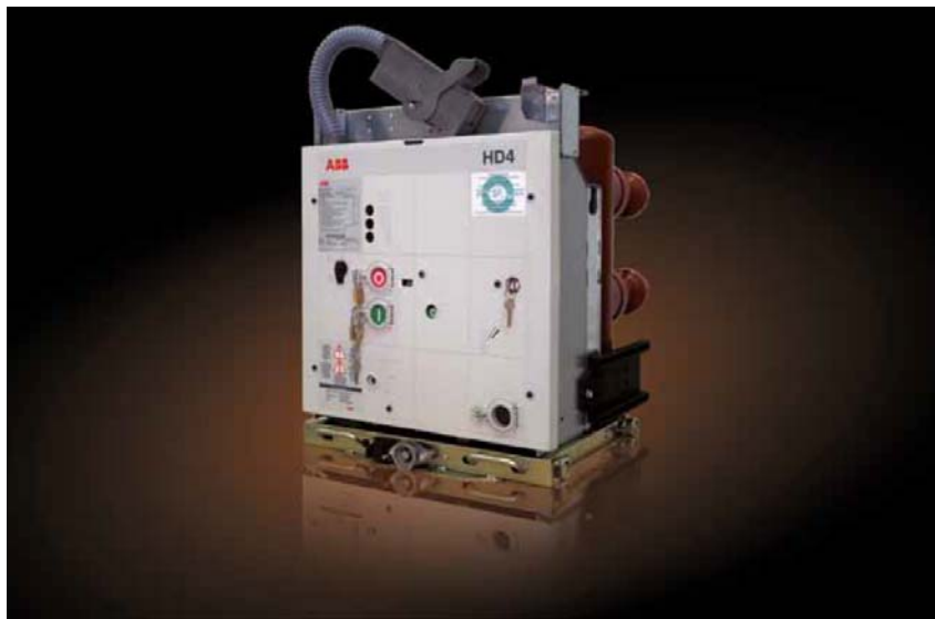
ABB SpA Sede legale Registered Office Via Vittor Pisani, 16 20124 Milano - Italy www.abb.it

The updated HD4 is still based on auto-puffer quenching technique and has been certified according to latest edition (ed.2.1-2012) of IEC 62271-100.