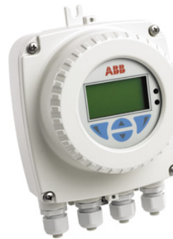
ProcessMaster, WaterMaster, AquaMaster

— To find your local ABB contact, visit: