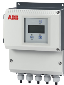
MagMaster, XE, XM, AquaMaster, FSM4000