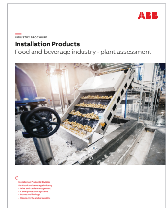
ABB Installation Products Plant assessment