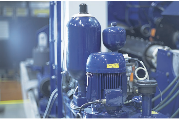
Wind turbine nacelle after cleaning and refurbishment