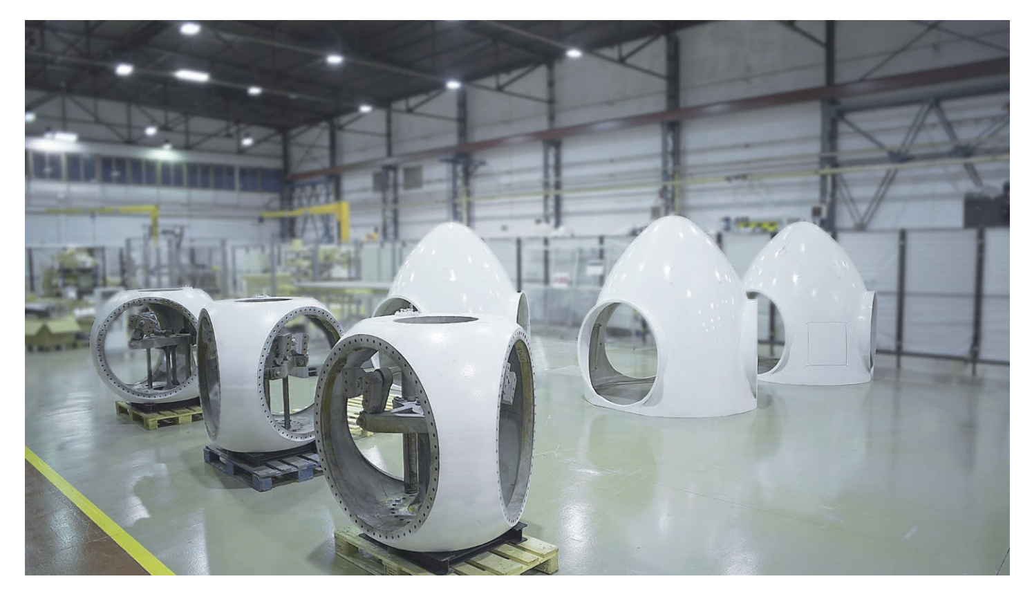
Wind turbine dismantled components to be remounted after the retrofit by ABB's Service Center of Excellence

ABB is the largest supplier of electrical components, systems, and services to the wind power industry. With continued investment and expansion of service offering, ABB is uniquely positioned to support and optimize your turbine and wind power plant throughout the entire life cycle.