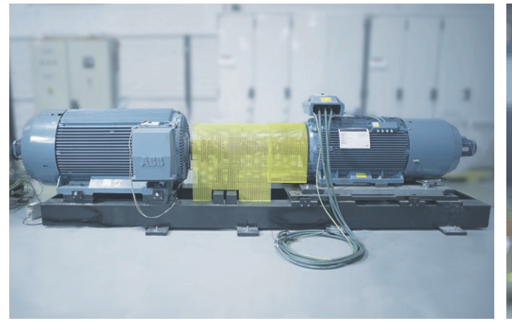
Test Bench at ABB's Service Center of Excellence