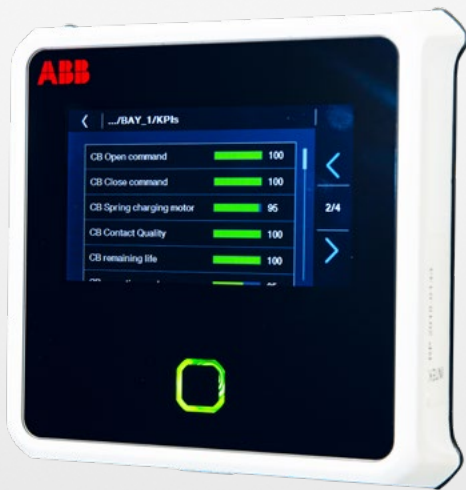
ABB Ability™ Condition Monitoring for switchgear SWICOM - Reliable asset management