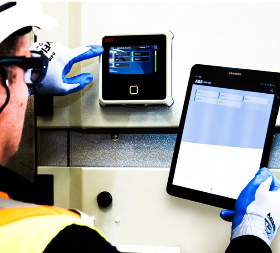
— 02 SWICOM mobile app