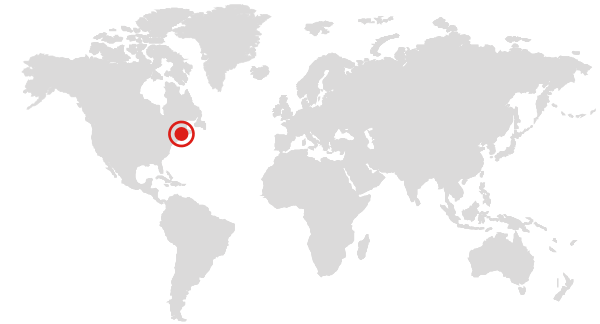
ABB installs the largest Voltage Source Converter in North America to ease the network congestion and enable a more reliable and stable electrical grid.