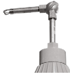
XPP – Adjustable pendant mount