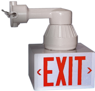
EFXPW – Wall mount