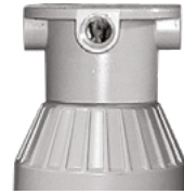
EFXPC – Ceiling mount