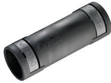
Connection Splice for flexible Conduits