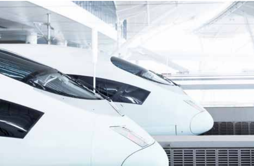
ABB traction motors Electric multiple unit (EMU)

Few or several driven axles? ABB provides traction motors for both EMU design concepts, reflecting train manufacturers' core design values – while also helping customers to optimize their propulsion solution.