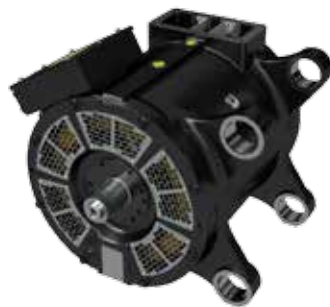
ABB EMU motors

ABB offers customized traction motors based on pre-defined and proven technology platforms. We select technologies for e.g. rotors, suspension and cooling to cost-effectively tailor motors according to customer specification.