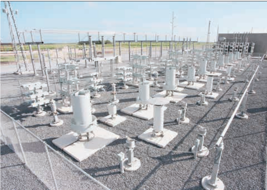
ABB is currently constructing a second 150 MW back-to-back HVDC converter station adjacent to the existing site. The two stations, part of the Railroad DC Tie Expansion project, will work in parallel to provide a transmission capacity of up to 300 MW. This will further increase the power transfer capacity between Texas and Mexico and secure the reliability of power in the Rio Grande Valley.

To learn more about ABB's reference projects, please visit www.abb.com/hvdc