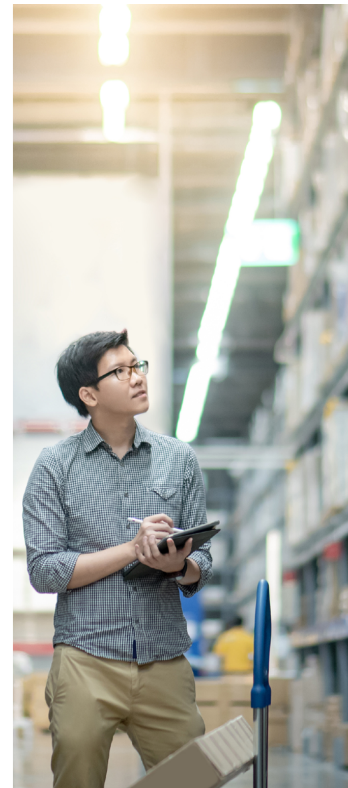
ABB reserves the right to conduct audits together with you at your sub-supplier (ABB tier 2) sites.

We encourage you to include diversity in your supplier base.