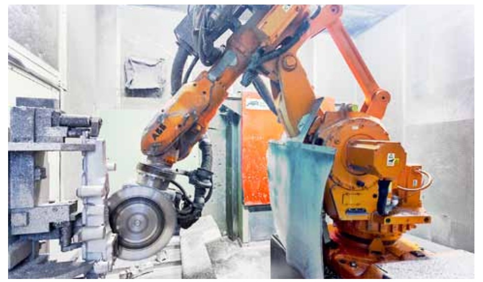
The adaptive motion controller adjusts the behavior of the IRB 6660 in response to the forces it encounters.

ecause of its low weight in relation to its strength, aluminum is one of the most important materials in the automotive industry. The MWS Group supplies almost all major manufacturers and specializes in the production of highly complex, readyto-install aluminum castings. At Garching, near Munich, the company uses sand casting to manufacture items such as engine mounts, differential housings and oil pans. These components are then cut and milled by a type IRB 6660 ABB industrial robot in a production cell manufactured by Automations Robotic GmbH. In this process, a worker clamps the raw parts in a workpiece positioner that carries the parts into the robot cell for processing. Once the robotic processing is complete, the part is transferred to the next work station.