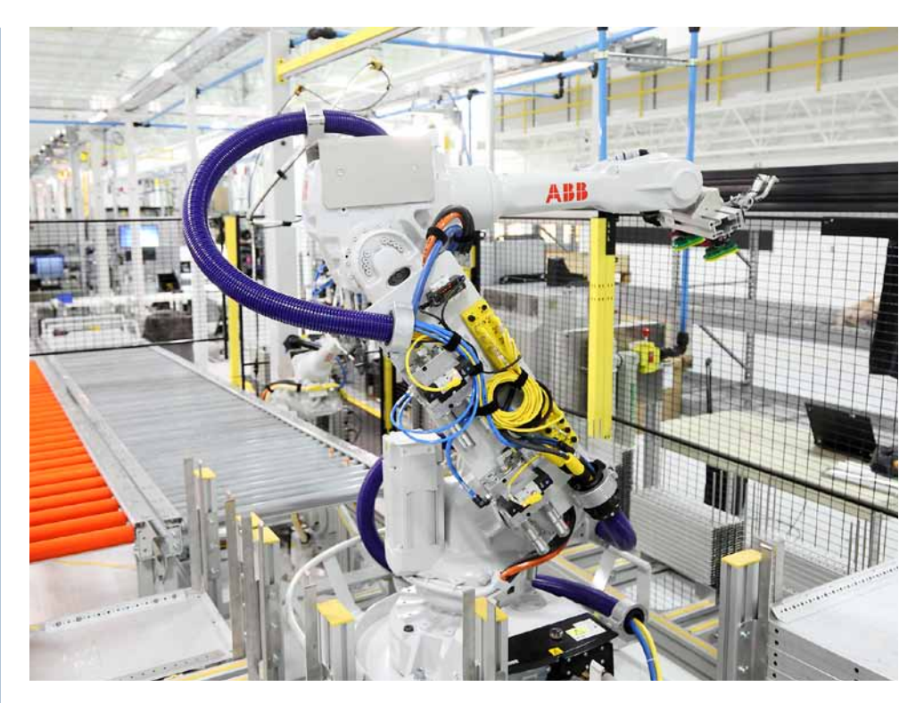
ABB opens US facility