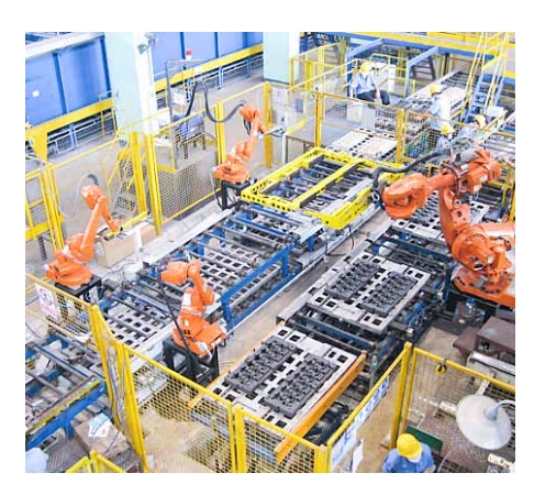
Robots operating in a sand core cell on a cylinder heads manufacturing line in China.

ABB has more than 20 years of experience in sand-casting robot automation. "This deep knowledge, combined with our robots, enables us to offer Loramendi safe, flexible, accurate, and productive solutions," Edo adds.