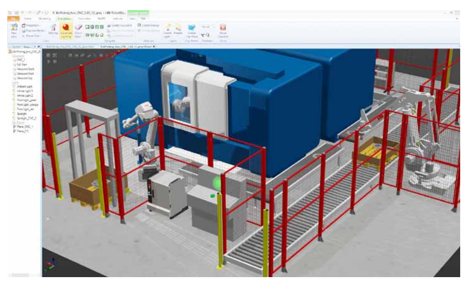
ABB's simulation and offline programming software, RobotStudio, allows robot programming to be done on a PC in the office without the need to shut down production.

However, with the availability of skilled labor dwindling, especially in rural regions, it can be difficult to figure out how to invest for the maximum impact. Small- to medium-sized foundries are in a particularly tough position, given they are often located in rural areas. This is