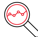
Credit Risk and Analysis