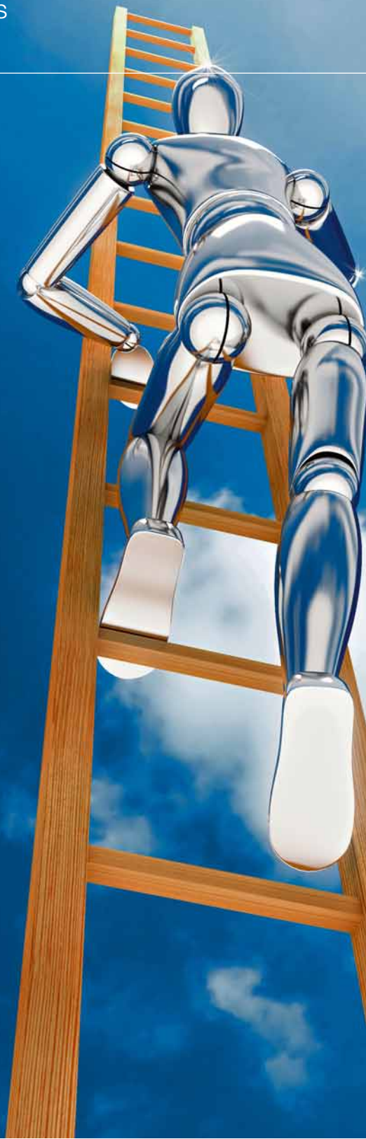
ABB offers a consultancy service with expertise in the areas of maintenance and reliability, process safety, and industrial energy efficiency. ABB's consultants have a wide range of experience and a good track record, assisting industries with critically important decisions for their profitability and survival.

To make sound decisions that allow a company to capitalize on a rapidly growing economy or to weather a storm requires expertise, which may not always be available in-house.