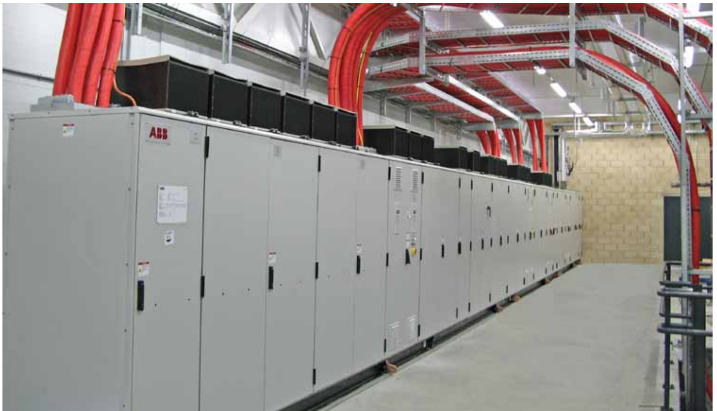
ACS 6000 multidrive, with a total rated power of 36 MVA, controlling the test benches at CENER.