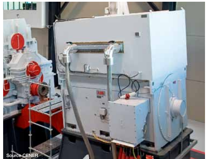
ABB motor at one of CENER's test benches

The motor of the generator test bench is controlled by INU 3 of the ACS 6000.