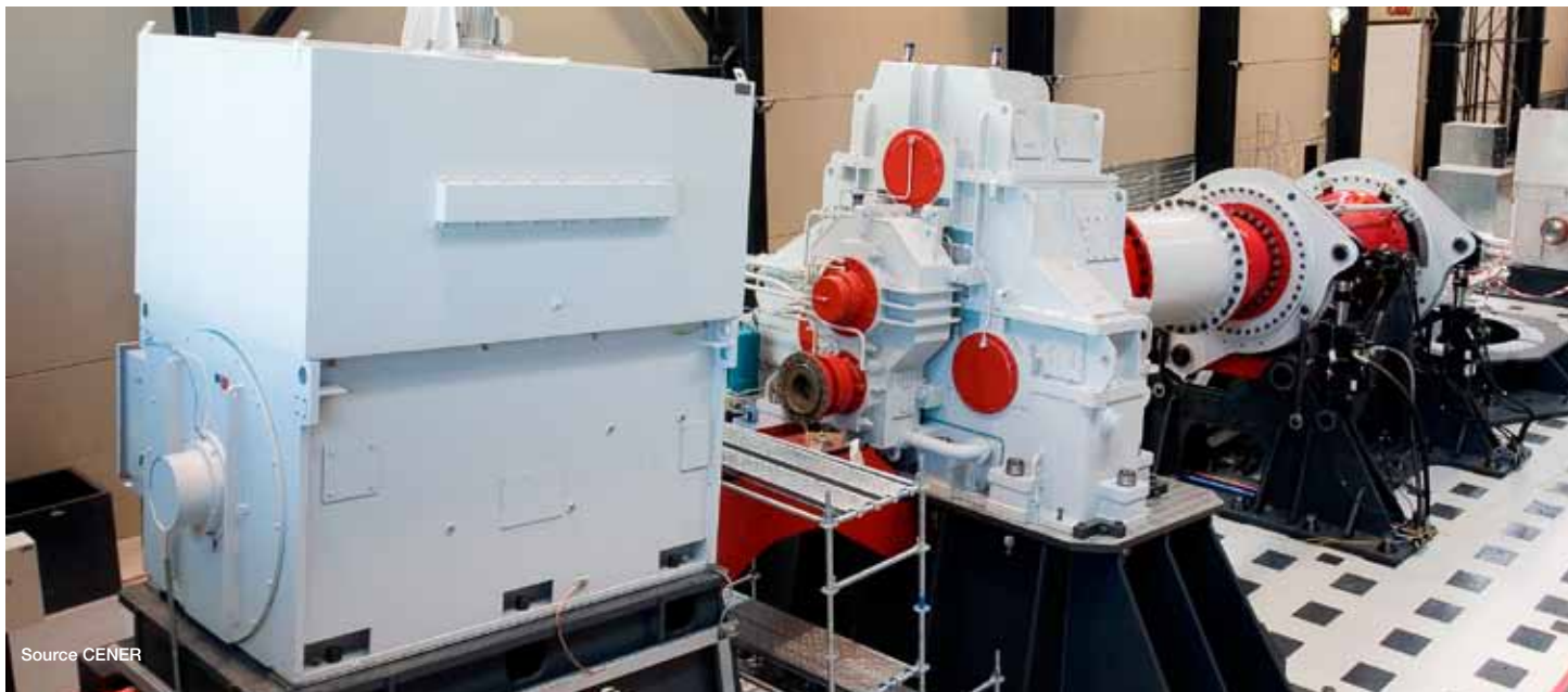
The power train test bench in CENER's wind test laboratory is controlled by ABB's ACS 6000 variable speed drive.

Spain's National Renewable Energy Center (CENER), has one of the world's most modern wind turbine test laboratories.