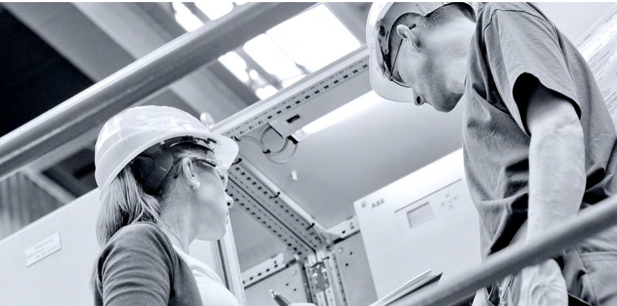
ABB Ability™ Axis Contractor Work Management replaces paper-based processes with an electronic collaboration platform. The solution covers all core Contractor Work Management processes, including work allocation, work update, work completion and invoicing.

Improving contractor efficiency with the power of mobility and the cloud