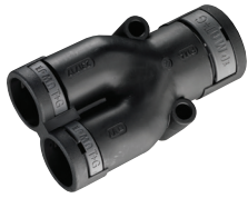
Y Piece IP68