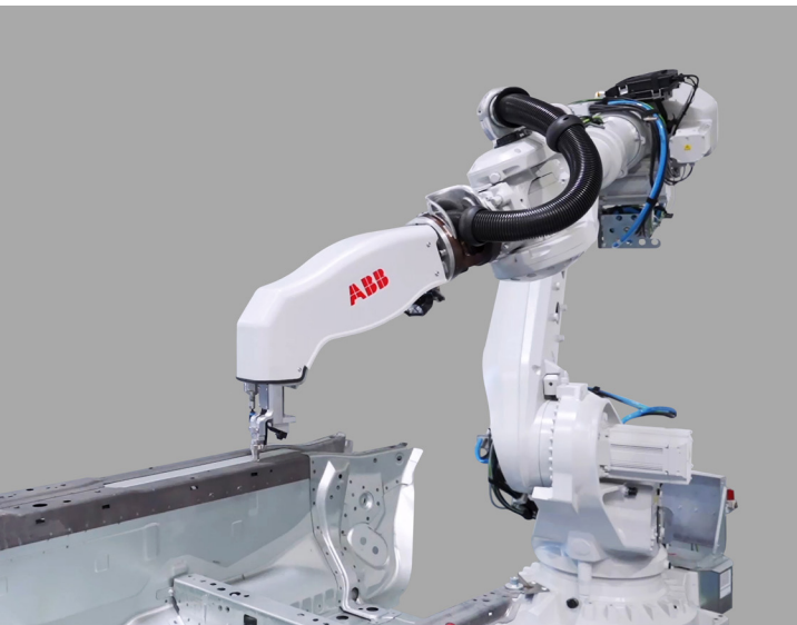
ABB offers a complete robotic solution based on ultrasound, for quality inspection of spot welds. The Ultrasonic Spot Welding Quality Inspection is a functional module ready-to-use: an integrated solution optimized for a fast and accurate inspection.

— 01 Ultrasonic Spot Welding Quality Inspection functional module