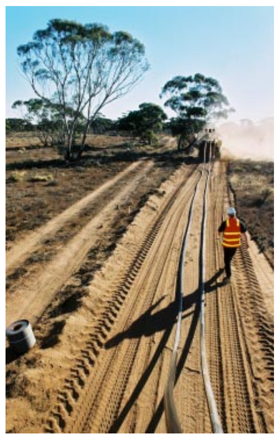
Burying of the land cable.

One early experience from the Murraylink operation is the effect of this voltage control at the connection points of the AC networks. Normally the AC networks worked with fairly high voltage variations. The voltage variations have become insignificant from the start of operations on the Murraylink transmission system.