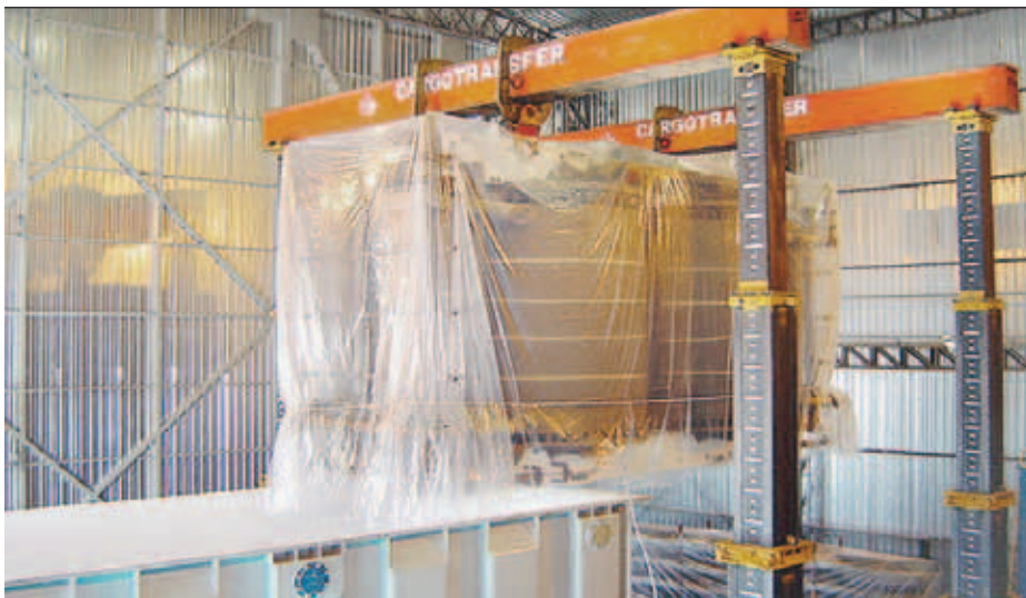
2 Untanking at site of a 440 MVA/550 kV transformer to replace windings

The transformers service solutions developed in recent years aim to help transformer owners optimize their lifetime asset management strategy, minimize cost of ownership and overcome the challenge of expertise maintenance.