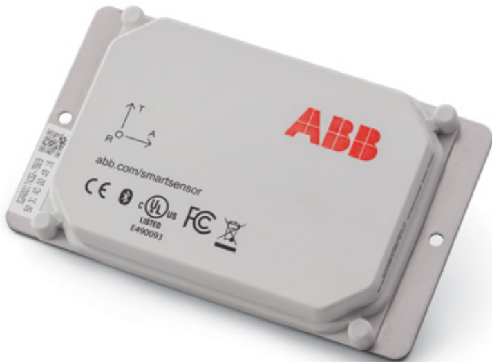
ABB Ability™ Smart Sensor Condition monitoring for pumps

The ABB Ability™ Smart Sensor converts traditional pumps into smart, wirelessly connected devices. It enables you to monitor the health of your pumps, identify inefficiencies and improve reliability and safety.