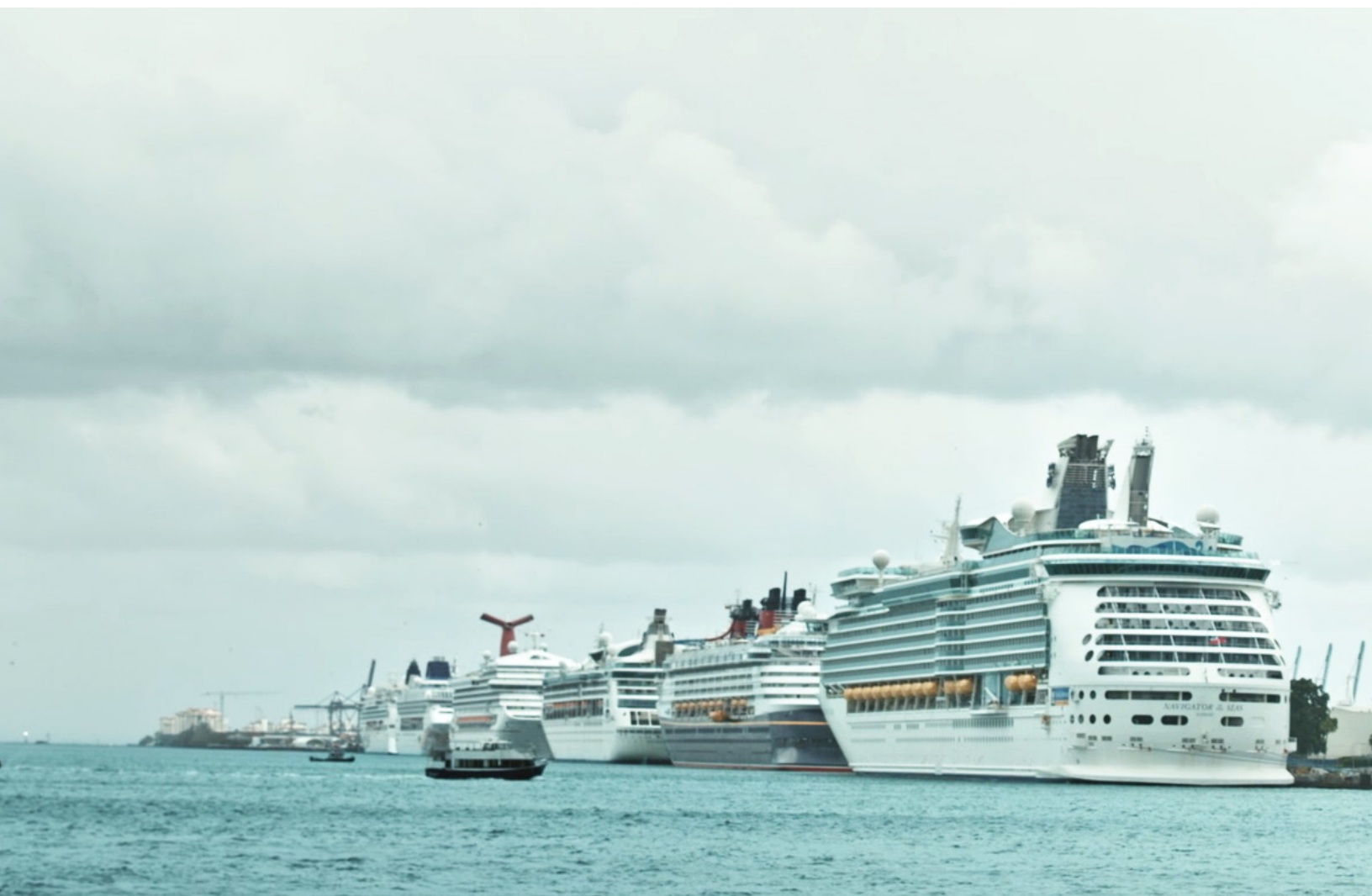
ABB Ability™ Marine Advisory System - OCTOPUS Passenger vessels