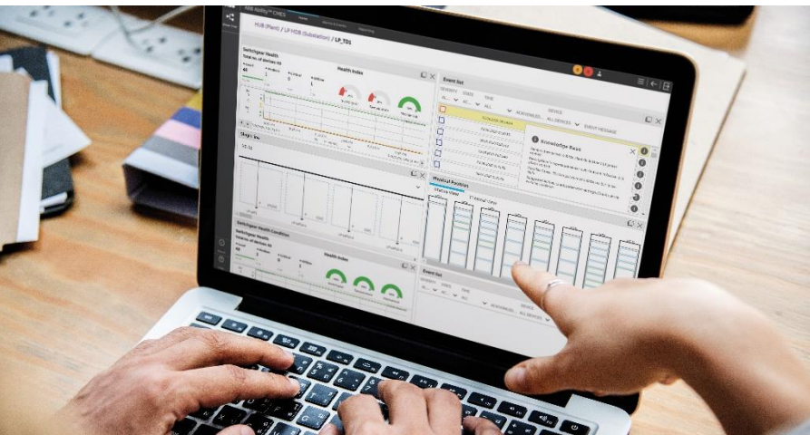
ABB Ability™ Condition Monitoring for electrical systems (CMES)

Monitoring and analyzing switchgear conditions continuously through the ABB Ability™ CMES solution ensures continuous switchgear operation with early detection of potential risks, reducing unnecessary switchgear maintenance and enables the move to predictive maintenance processes and reduces operational costs.