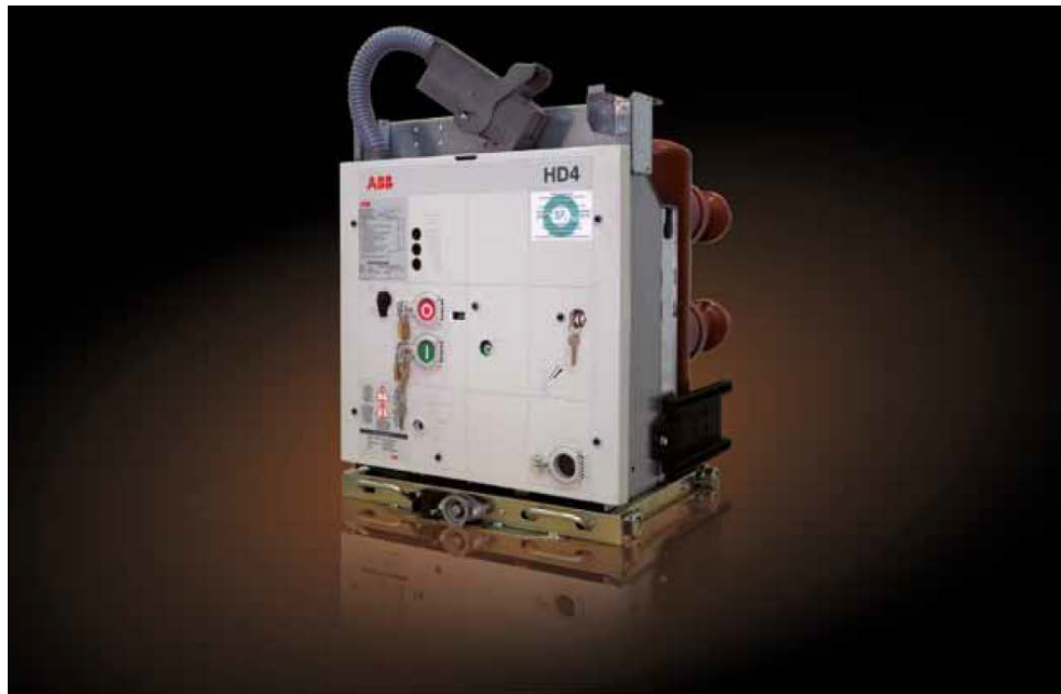
ABB SpA Power Products Division Sede legale Registered Office Via Vittor Pisani, 16 20124 Milano - Italy www.abb.it

After about 20 years of successful sales and service on various fields of application, PPMV gas insulated MV indoor circuit-breaker series HD4 has been updated on the most sold ratings. The following technical note is to inform about the update of types at 12/17.5 kV up to 1250 A and up to 25 kA. The updated HD4 is still based on auto-puffer quenching technique, it is filled-in with SF6 gas at the same absolute pressure of the previous corresponding types and has been certified according to latest edition (ed.2.1-2012) of IEC 62271-100.