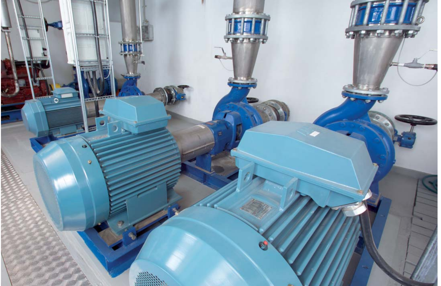
Parallel AC drives and pumps provide system redundancy at pressure boosting station.