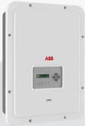
UNO-DM-3.3/4.0/4.6/5.0-TL-PLUS outdoor string inverter

UNO-DM-3.3/4.0/4.6/5.0-TL-PLUS 3.3 to 5.0 kW