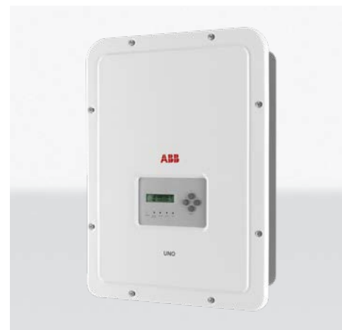
ABB string inverters UNO-DM-3.3/4.0/4.6/5.0-TL-PLUS 3.3 to 5.0 kW