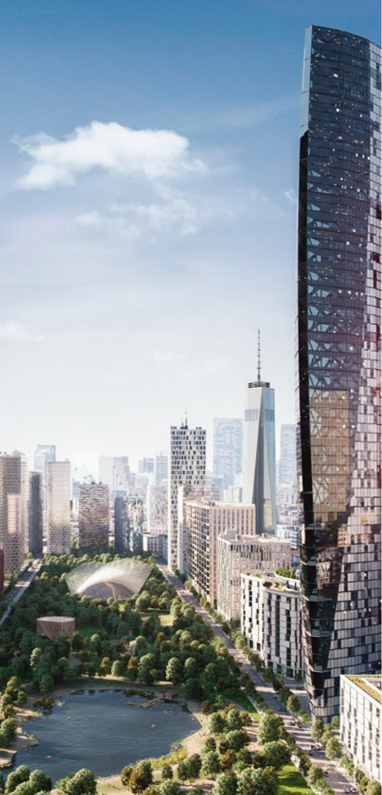
ABB Cylon® Smart Building Solutions for HVAC Control