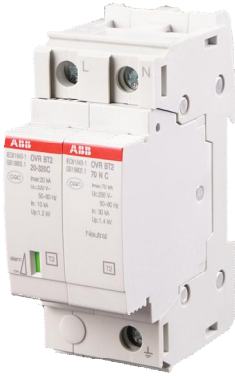
OVR BT2 1N-20-320 P