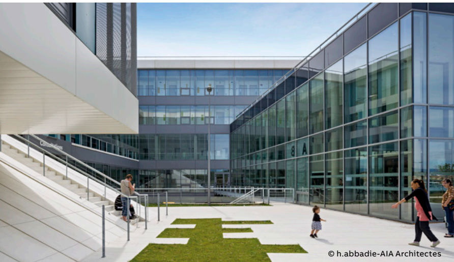
ABB provides solutions (products, systems, services) for a reliable power supply, sustainability of the facility and comfort and safety of patients and occupants. Connected digital solutions and advanced technologies provide hospitals with new insights and possibilities to reduce CO 2 footprint and ensure efficient operation.

Combining reliability, efficiency and safety