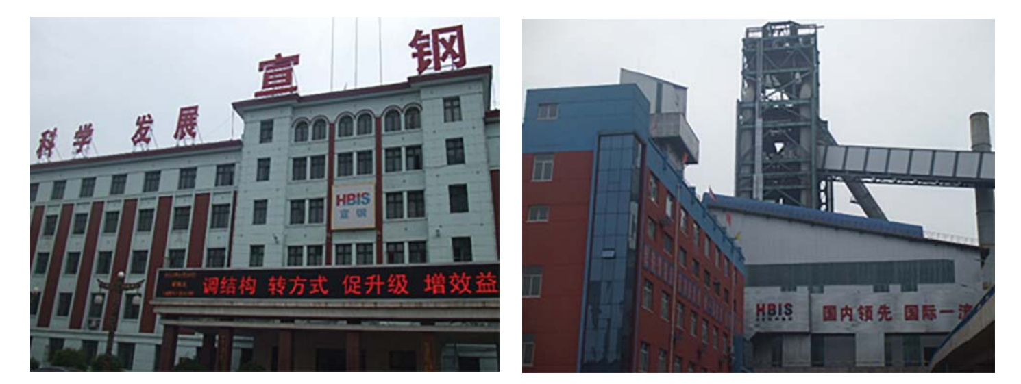
From left: Xuanhua Iron & Steel Co., Ltd. in Zhangjiakou, Hebei province; Blast furnace #2