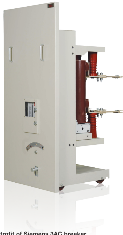
ABB VD4 retrofit of Siemens 3AC breaker

For more information please contact Service department at: