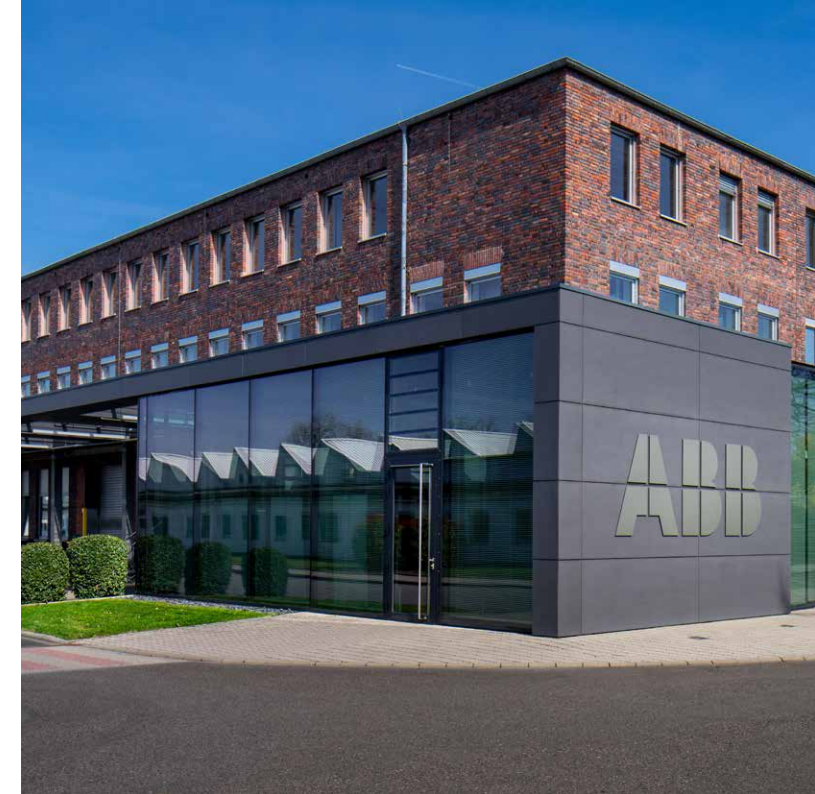
ABB STOTZ-KONTAKT Heidelberg