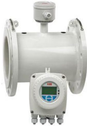
Figure 2 WaterMaster Remote Form