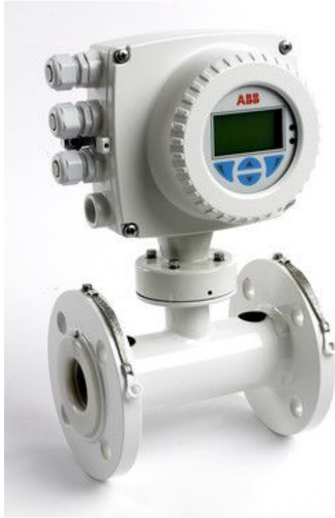
Figure 1 WaterMaster Integral Form