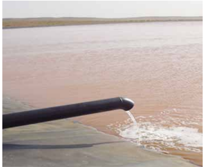
Treated water evaporation basin

This is a huge improvement in the results of alternative water treatment methods that are currently used by the oil and gas industry, and is thought to be the only treatment method that meets the rigorous requirements of proposed European legislation on produced water.