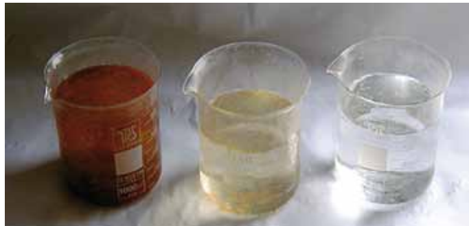
Water before, during and after treatment