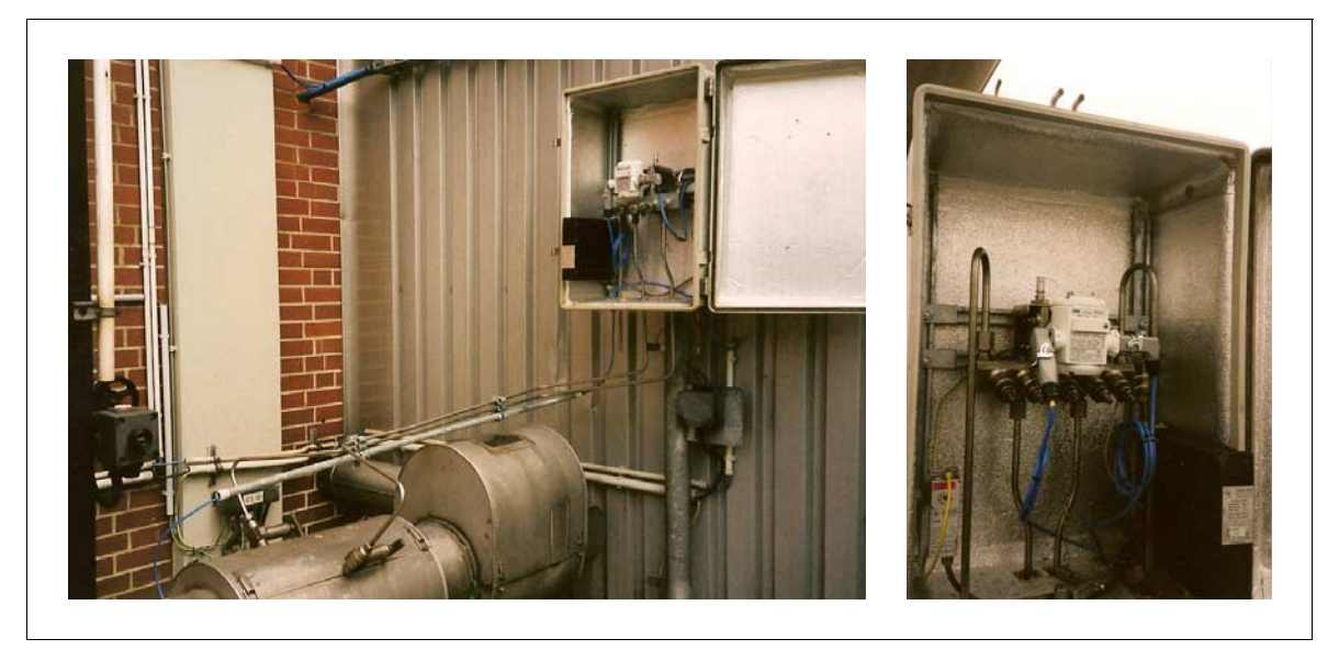
Fig. 2-1: Example of a set up measuring point

The differential pressure and absolute pressure are directly measured by the transmitter, whereas a Pt100 temperature sensor must be connected to the multivariable transmitter for the process temperature measurement. The necessary terminals are provided in the device's terminal compartment in addition to the signal and power supply terminals.