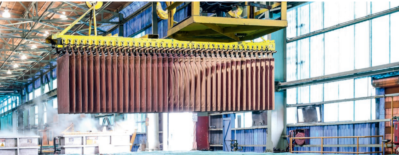
Copper refining plant