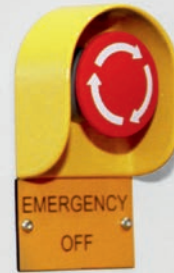
Control panel display