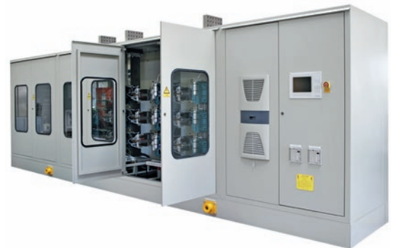
Typical MCR rectifier for indoor electrowinning installations

ABB understands your process and guarantees continuous technical development along with innovations in electrowinning industries. Our regular participation in relevant committees and technical forums keeps us up to date in latest industry trends.