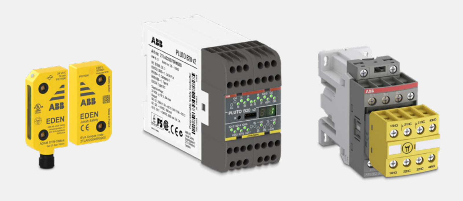
ABB Jokab Safety