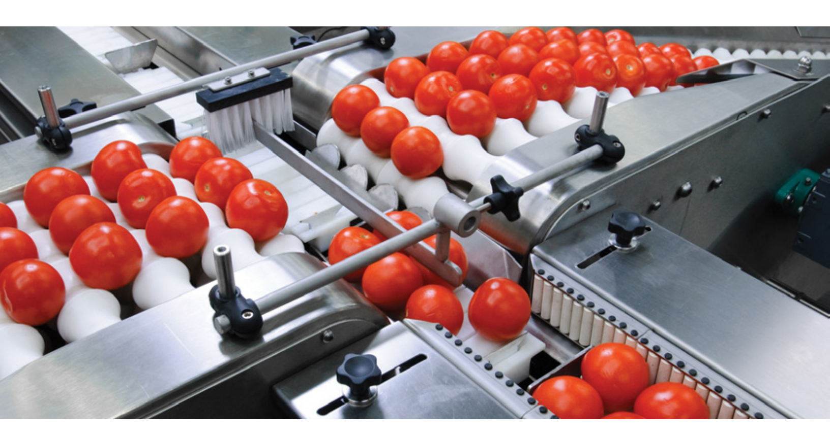
ABB Jokab Safety has long experience in developing products and solutions adapted for the harsh environment and requirements in the food and beverage industry.