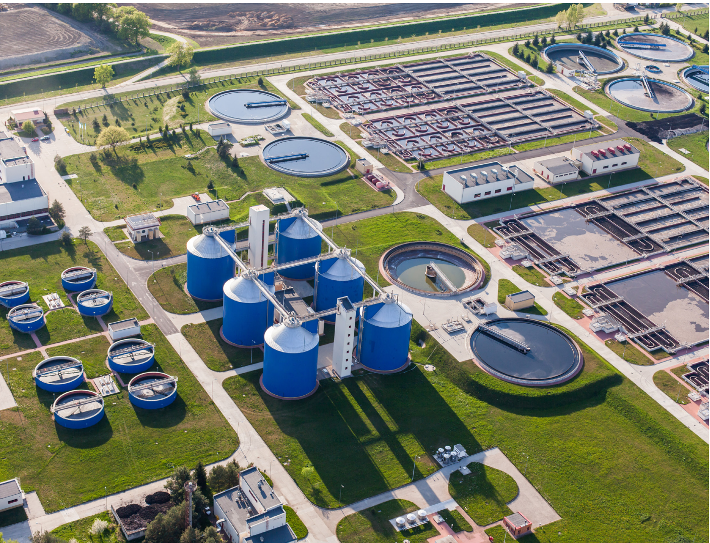
ABB Vertical Solution for the Wastewater Industry Enhancing your plant operations